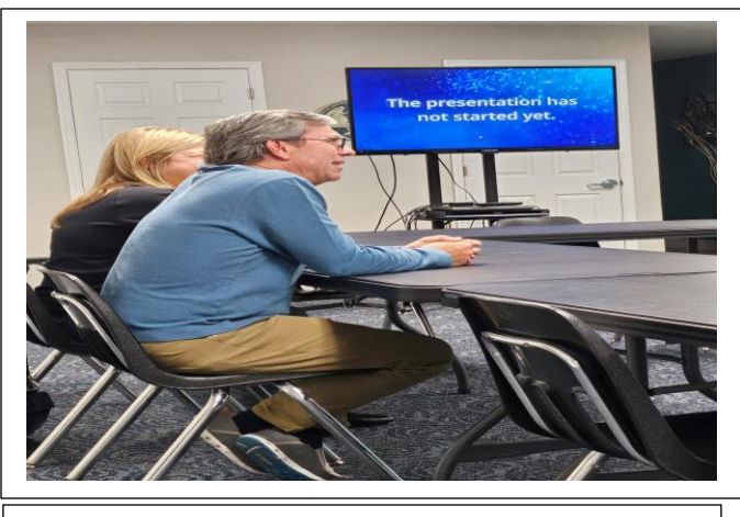
Attendees await the start of the webinar.